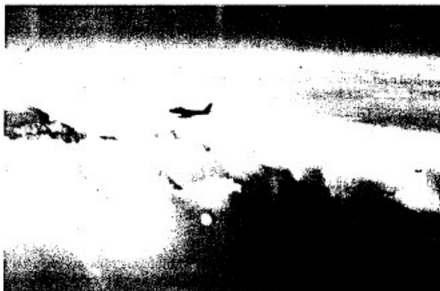
Fig. 2. Childerhose was flying west in the second position (left side) of a formation of four F-86 Sabre jets of the Royal Canadian Air Force.