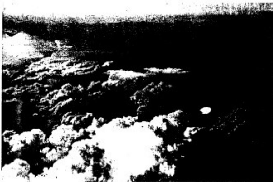
Fig. 1. Photograph of an unidentified high altitude bright light source. Picture taken by Royal Canadian Air Force pilot R. J. Childerhose on August 27, 1956 from an altitude of 36,000 ft (app. 11 km). The object was higher than app. 4 km and was observed for more than 45 sec. If acting as an isotropic Lambertian radiator, the power output within the spectral range of the film would have been in excess of 10^9 W. (Courtesy of Bruce Maccafee)